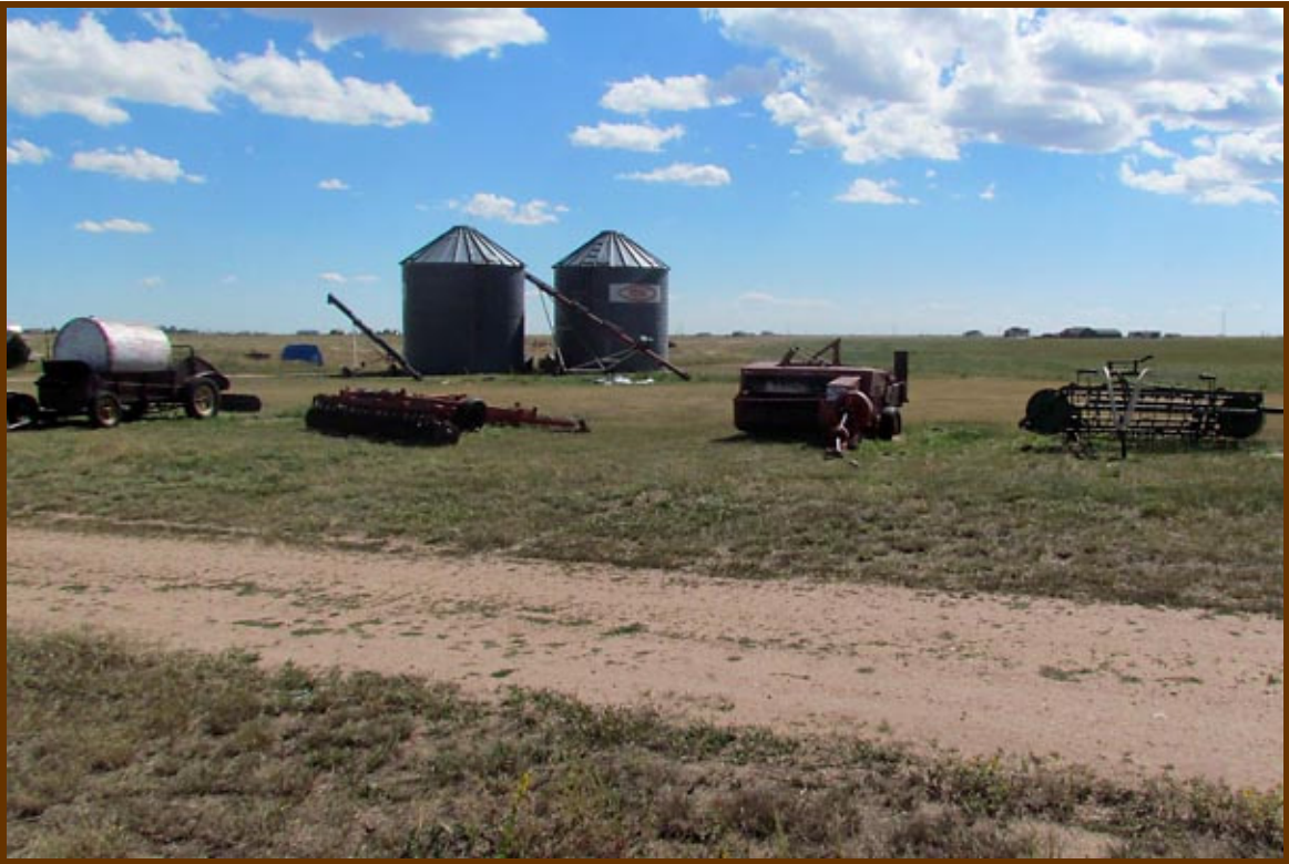
3,500 bushel grain storage bins with dryers on the floor.

Notice to Buyers: Wyoming Real Estate Law requires that the listing Broker and all licensees with the listing Broker make a full disclosure, in all real estate transactions, of whom they are agents and represent in that transaction. All prospective buyers must read, review and sign a Real Estate Brokerage Disclosure form prior to any showings. Clark & Associates Land Brokers, LLC with its sales staff is an agent of the seller in this listing.