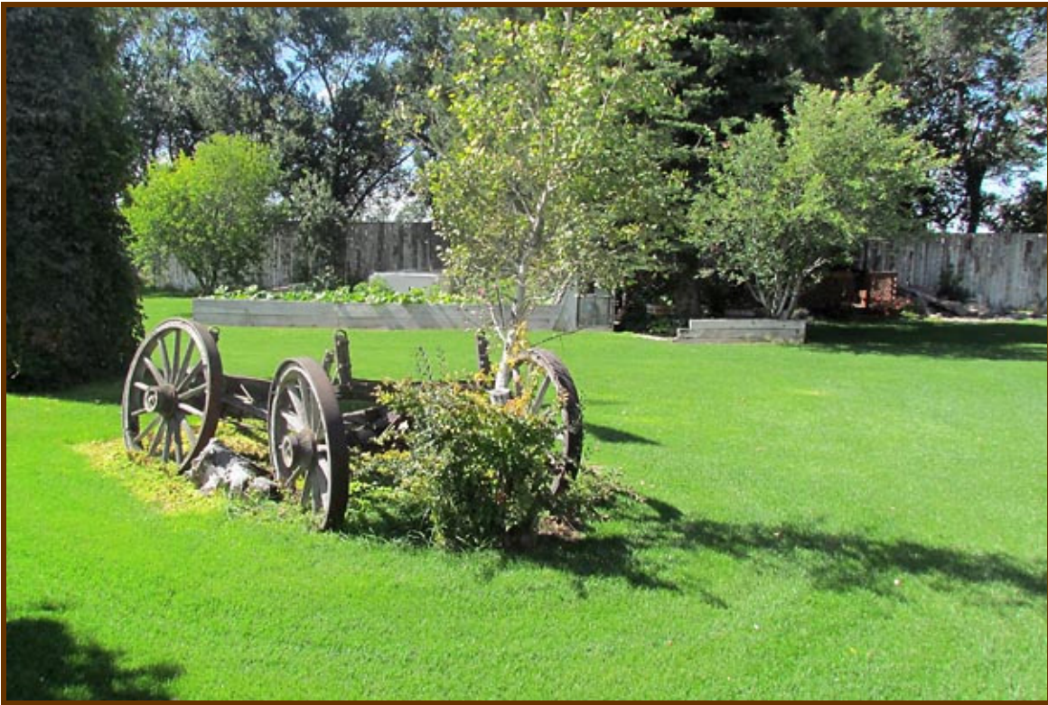
Beautifully landscaped yard with water fall, two sitting areas, windmill, water wheel, and wagon.