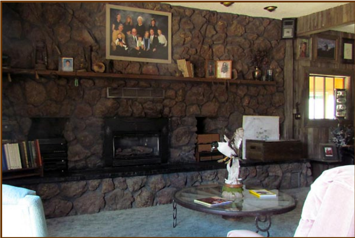
Custom/owner built home with beautiful rock fireplace.